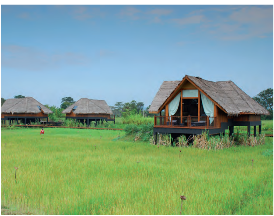
Jetwing Vil Uyana, Sigiriya