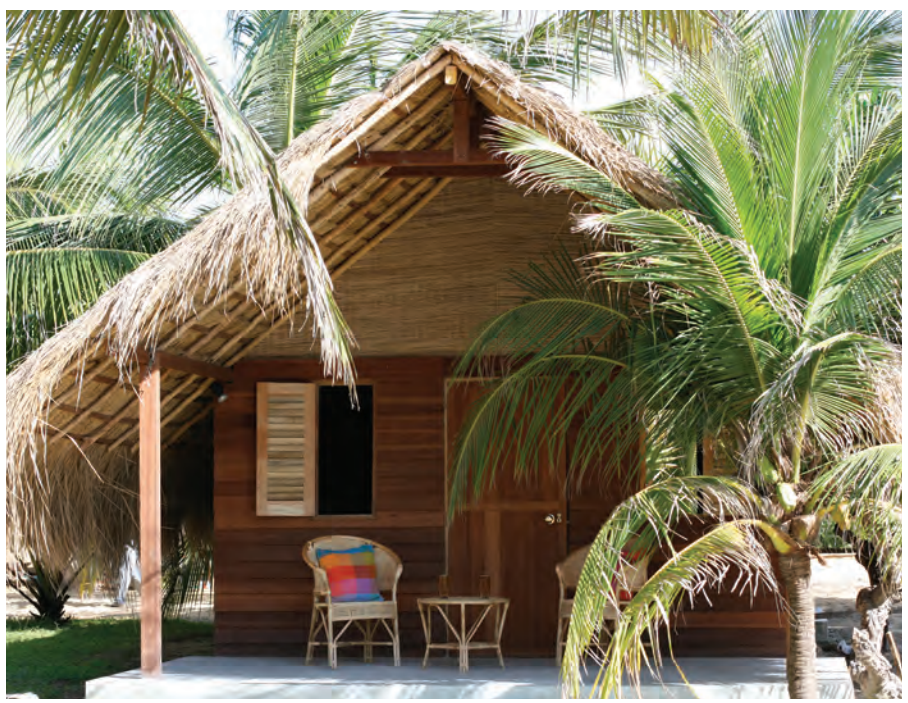
Palagama Beach Resort, Kalpitiya

In the ancient rural heart of Sri Lanka. The Mudhouse sits in a remote location about two hours' drive north of Colombo airport. Clusters of uniquely designed huts are located amidst 60 acres of forest land and have been built from local, natural materials, resembling all sorts of structures from a traditional village house to a tree house. Whilst each 'house' is different in layout and appearance, all have been designed with relaxation and comfort in mind and all the facilities are essentially the same, with outdoor showers and indoor bathrooms. All huts have dining areas and spaces which can be used for yoga and meditation. During your stay you have a number of different huts and structures allocated to you to 'call your own'. There is no mains electricity, but lighting at night is provided by candles and lanterns and the staff hut has solar panels and a limited supply of power for charging batteries. Guests stay on full board, eat in the main dining hut and meals are prepared in the traditional kitchen, mostly with firewood and clay pots, using much produce from the Mudhouse's own farm and garden. Guests are welcome to get involved with planting, watering or picking the produce. A stay here is an incredible experience in its own right but also for visiting local lakes and temples, bird watching and to visit the ancient city of Anuradhapura and sites of the Cultural Triangle. read more