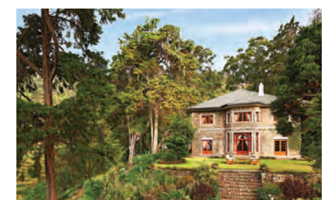
Jetwing Warwick Gardens, Ambewela

The Island Spa provides calming surroundings in which to relax with a treatment and guests will also be able to make use of the yoga pavilion. Specialist ayurvedic treatments are administered in a separate pavilion in the grounds. An excellent range of excursions are possible to explore the local area, from the Sigiriya Rock Fortress, which can be seen in the distance from the hotel, to elephant safaris, Loris watching in the hotel grounds and visits to the local village. Jetwing Vil Uyana near Sigiriya in Sri Lanka's Cultural Triangle combines luxurious surroundings with a real commitment to the local environment and its people. read more