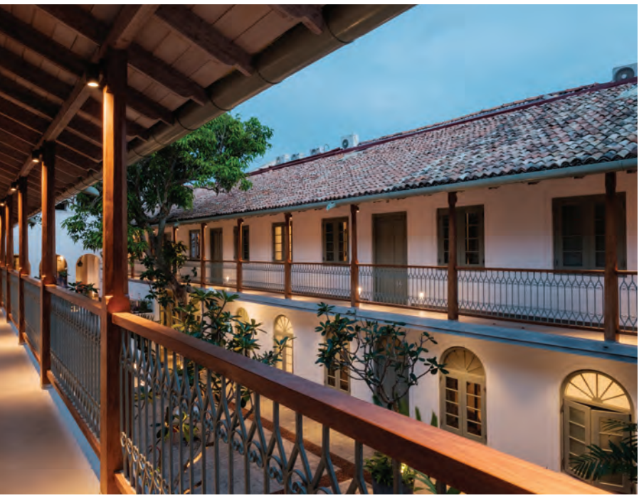
Fort Bazaar, Galle